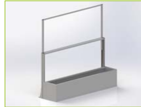
Option windscreen + fixed pot support.

Refurbish you terrace with a new pot support for your windscreen.