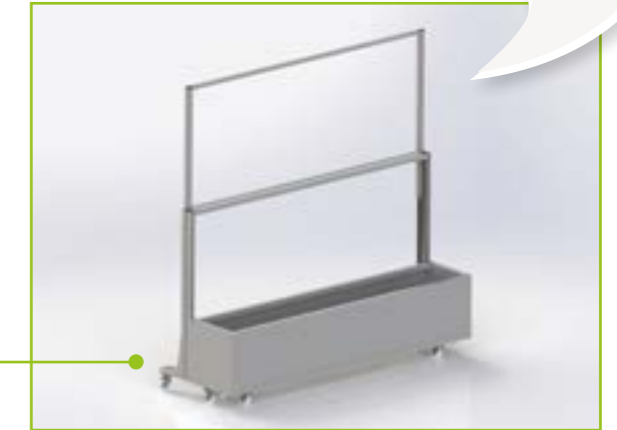
Option windscreen + bearing pot support.