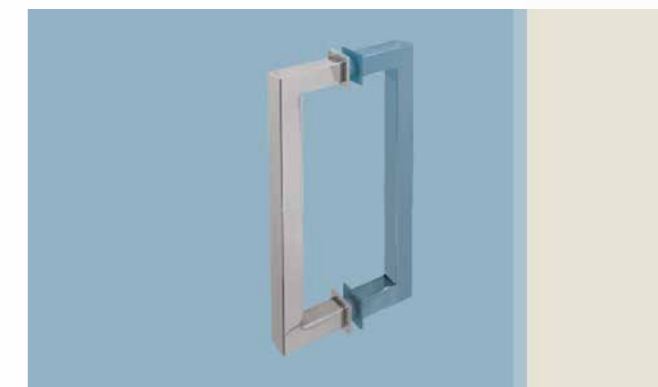
Door handle (double or simple)