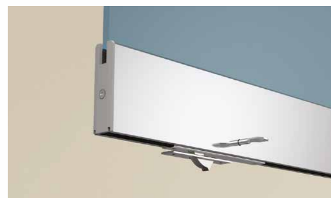
Opennig pane lock