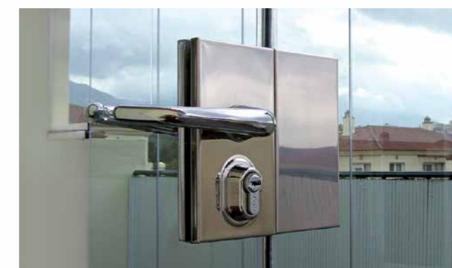
Glass installed lock (Crank)